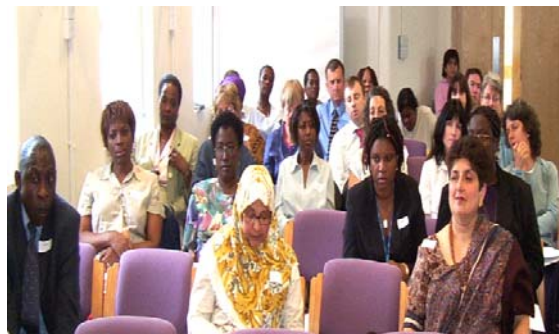
The Audience during the Conference - thanks to all who attended. -Ed